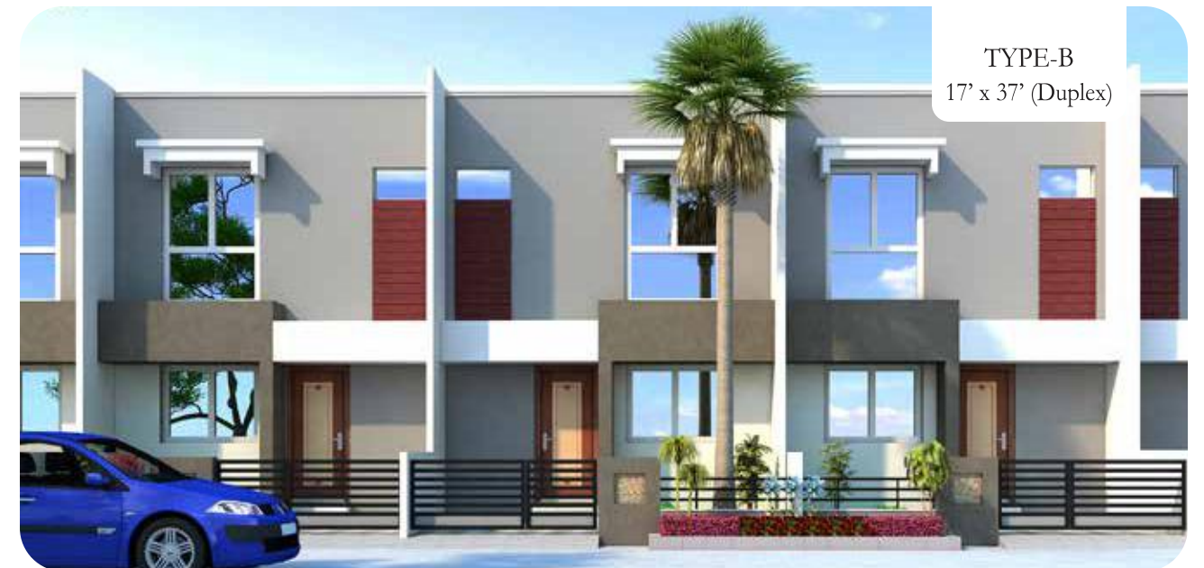
TYPE-B 17' x 37' (Duplex)