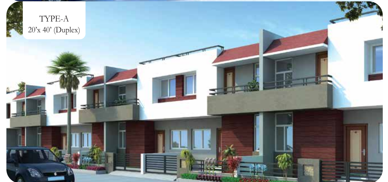
TYPE-A 20' x 40' (Duplex)