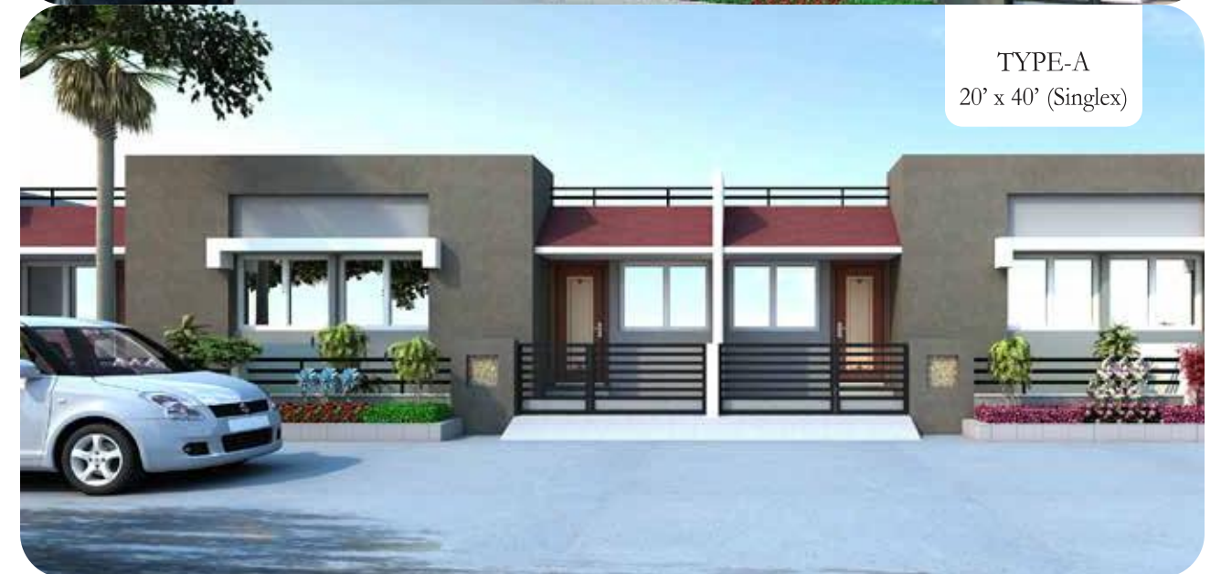
TYPE-A 20' x 40' (Single)