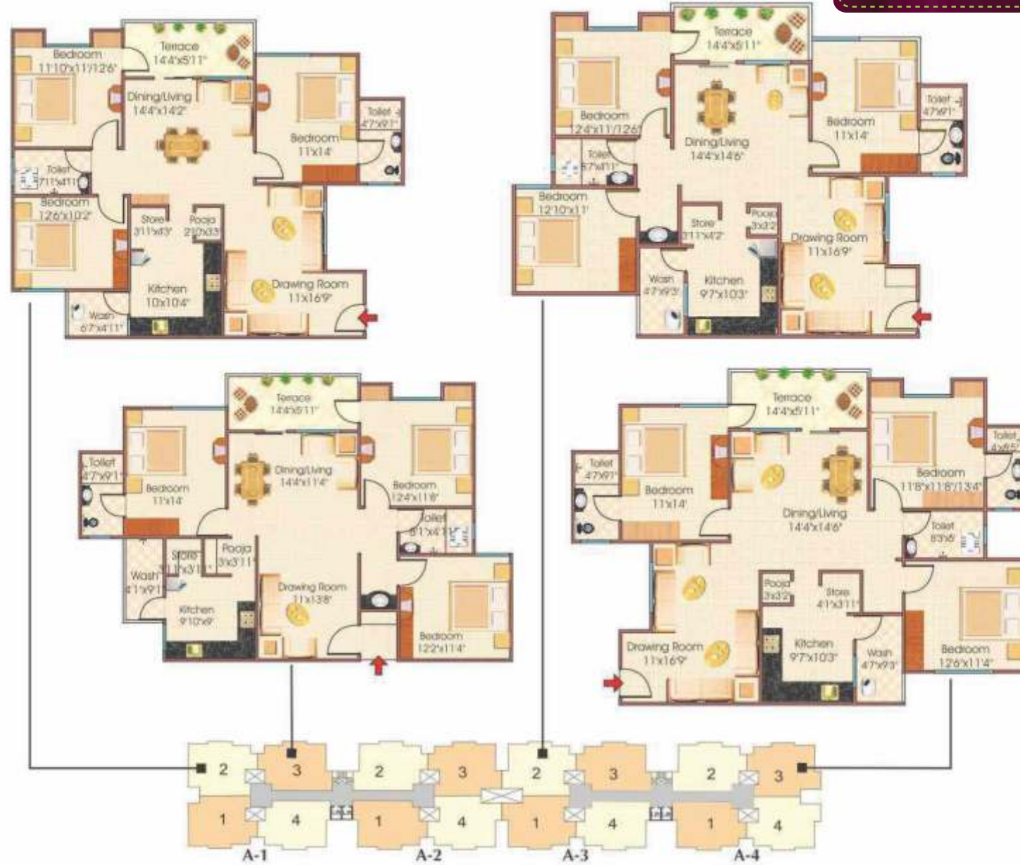
Typical Floor Plan : Block - A (3 BHK HIG)