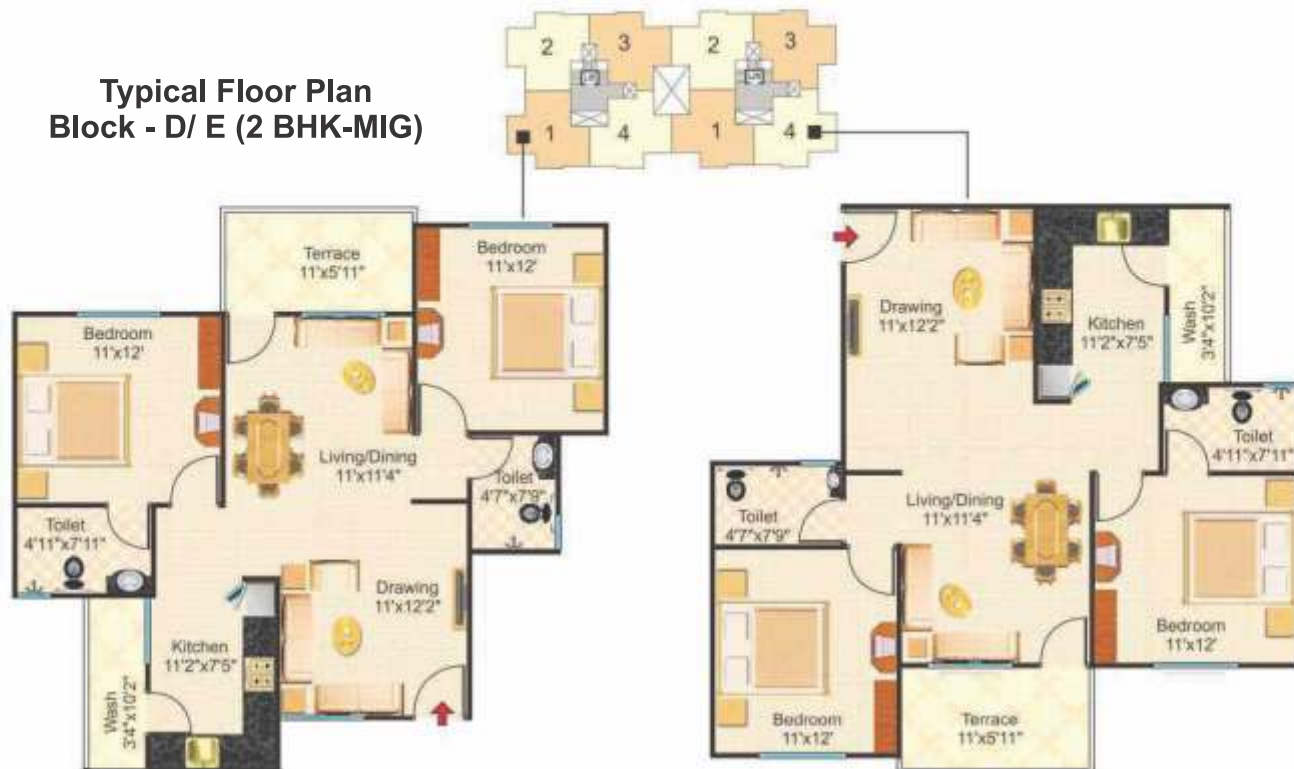
Typical Floor Plan Block - D/ E (2 BHK-MIG)