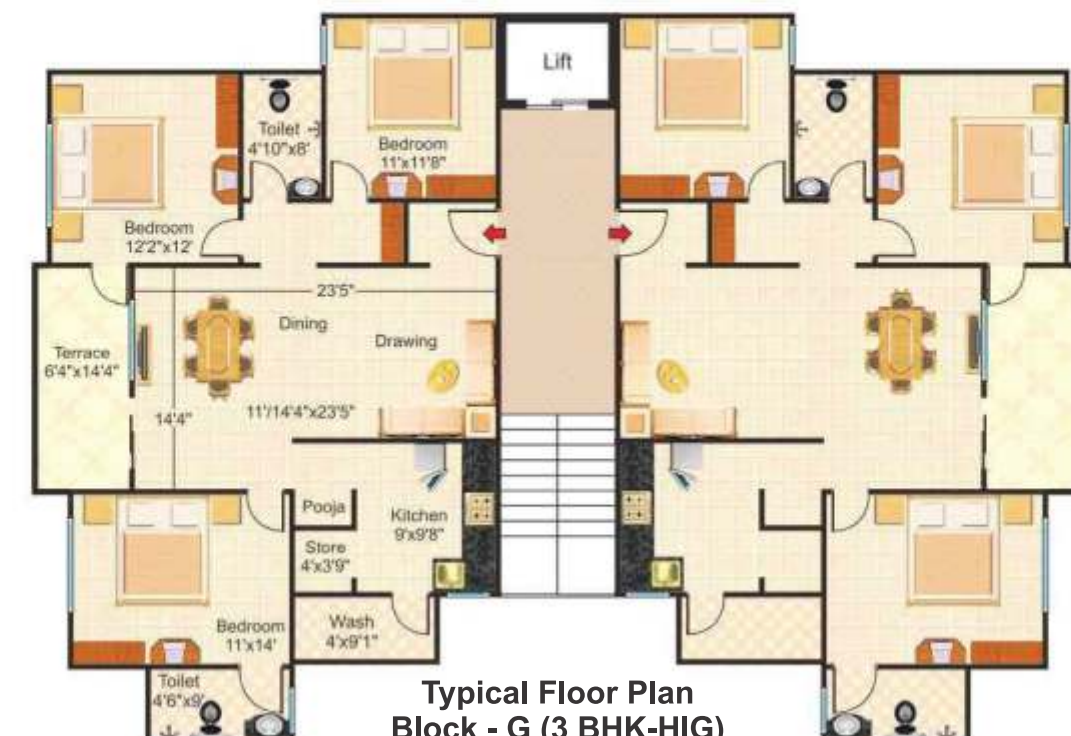
Typical Floor Plan Block - G (3 BHK-HIG)